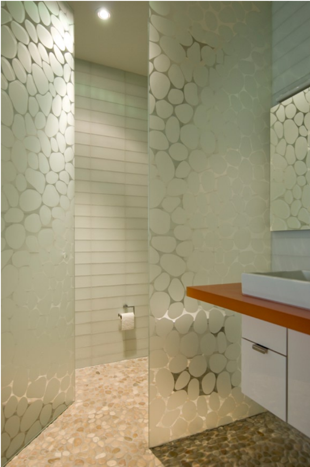
Etched glass and pebble floor